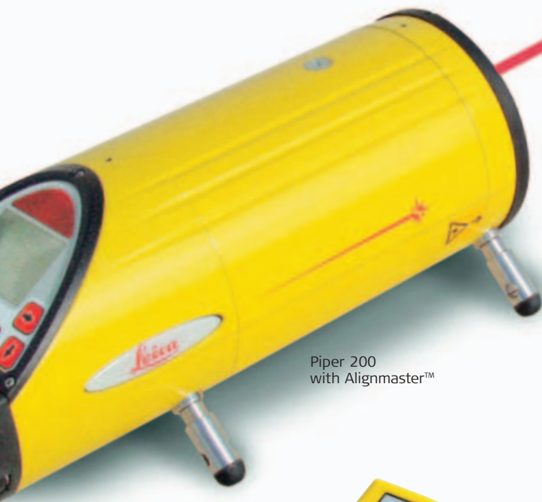
Piper 200 with Alignmaster™

Patented automatic targeting system searches and finds the target for second day setups.